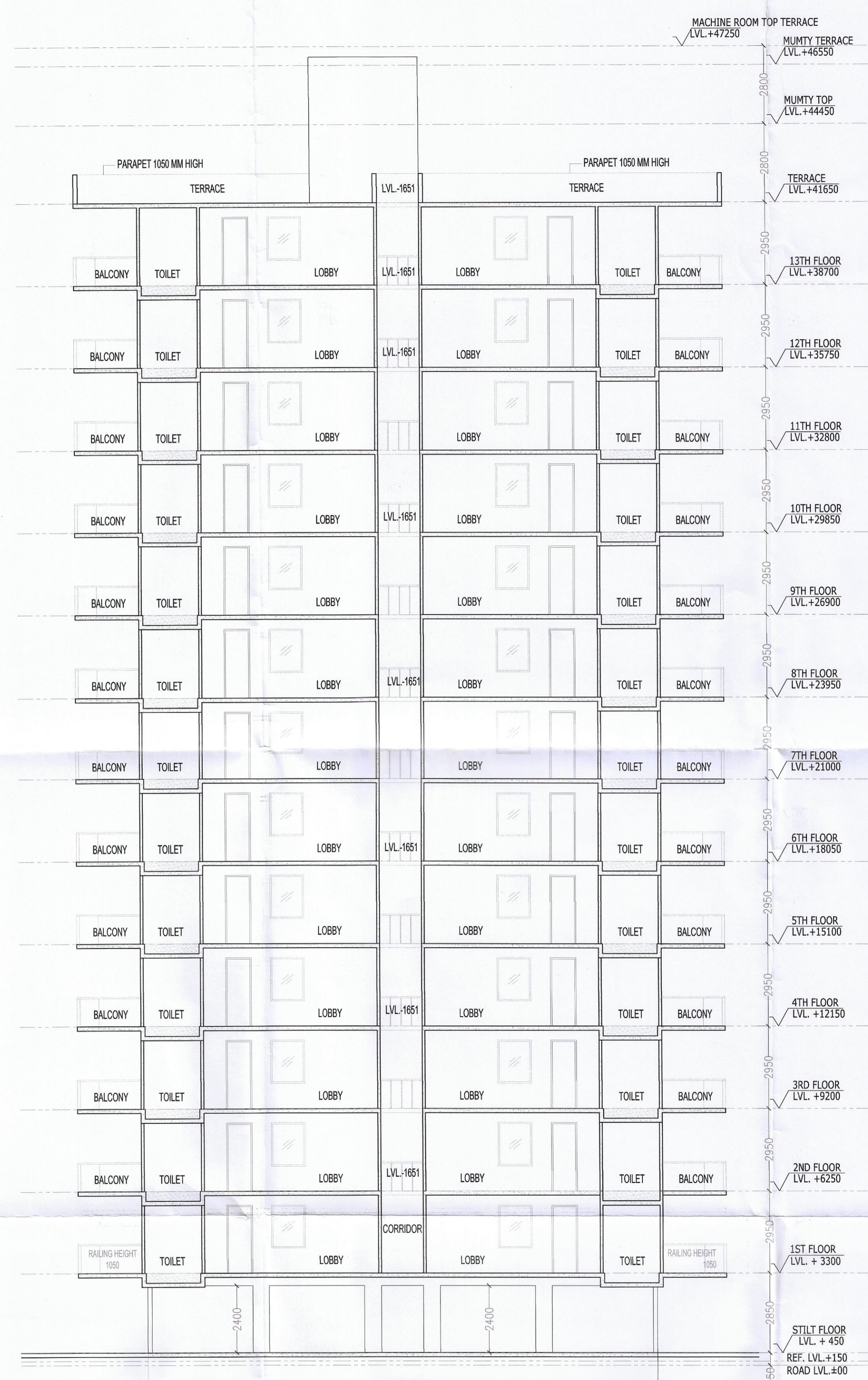
TOWER-2 SECTION -Y,Y